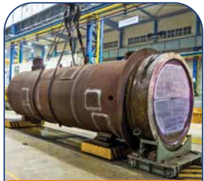
Pressure Part Supports Etc