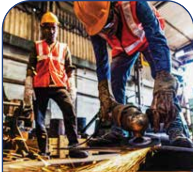
Engineering Structure Fabrication