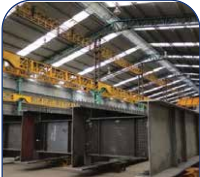
Heavy Structural Components Such As Beams, Columns, Bracing Etc