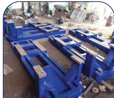
Base frames with milling