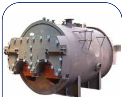
Vapour & Non IBR Tanks