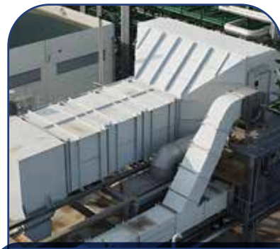
Hopper & Ducts